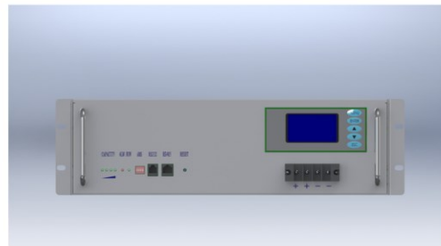
Figure 2 Front View of the Battery